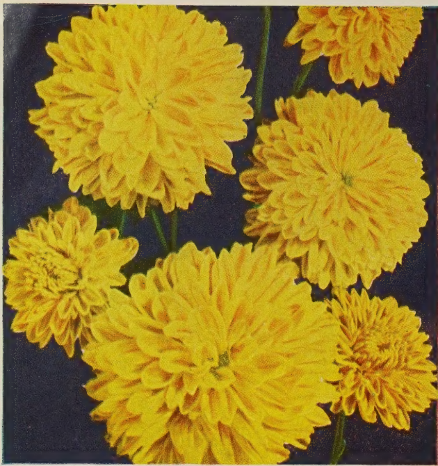
POMPONETTE. 60c each; 3 for $1.50